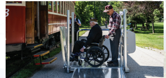
Streetcar is Handicap Accessible at both Prestige Inn and Lakeside Park stops.

Membership is available for $10 per year.